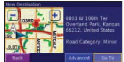
press "Go To!"