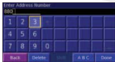
type in an address