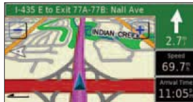
follow the route